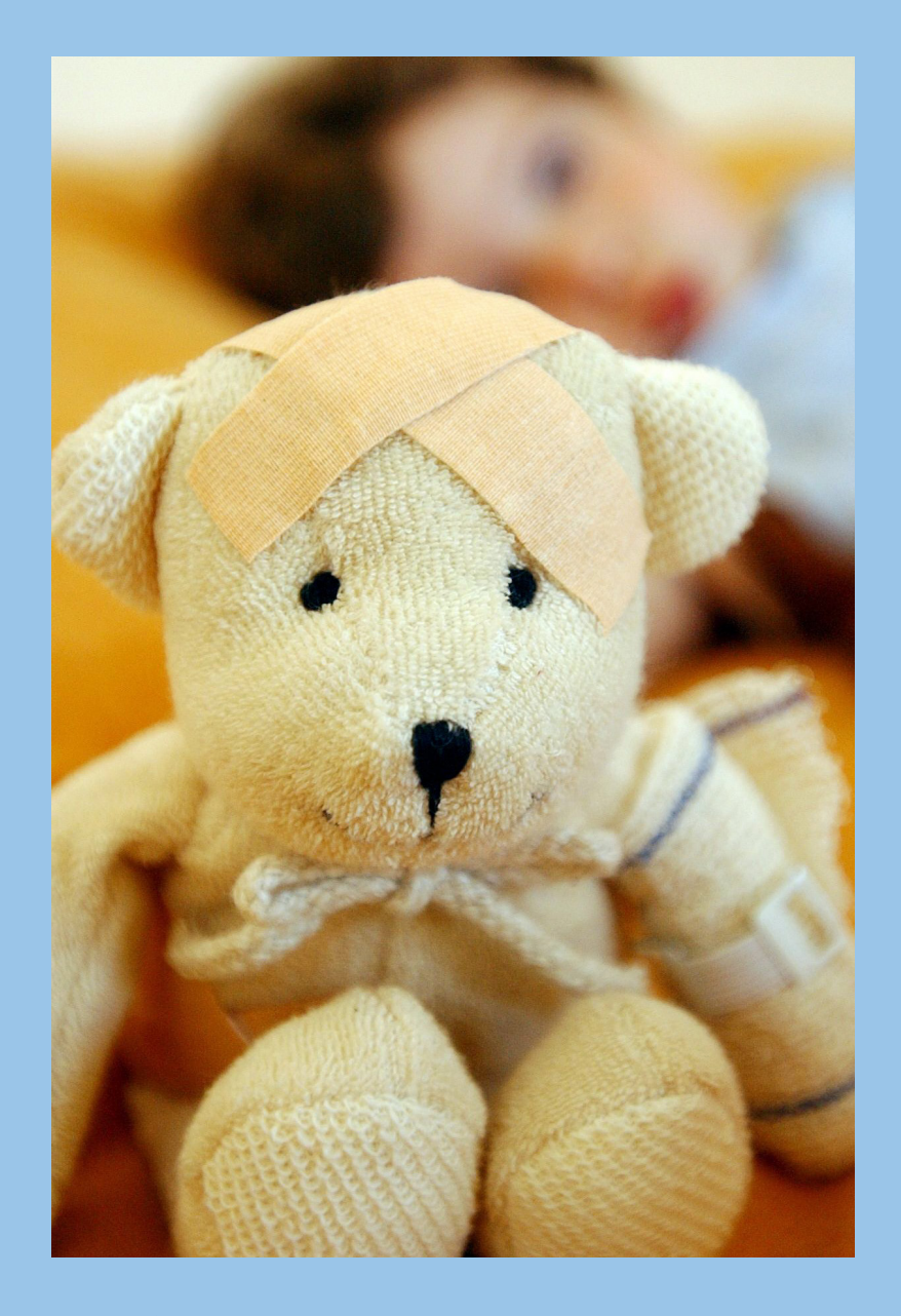
If your child gets sick